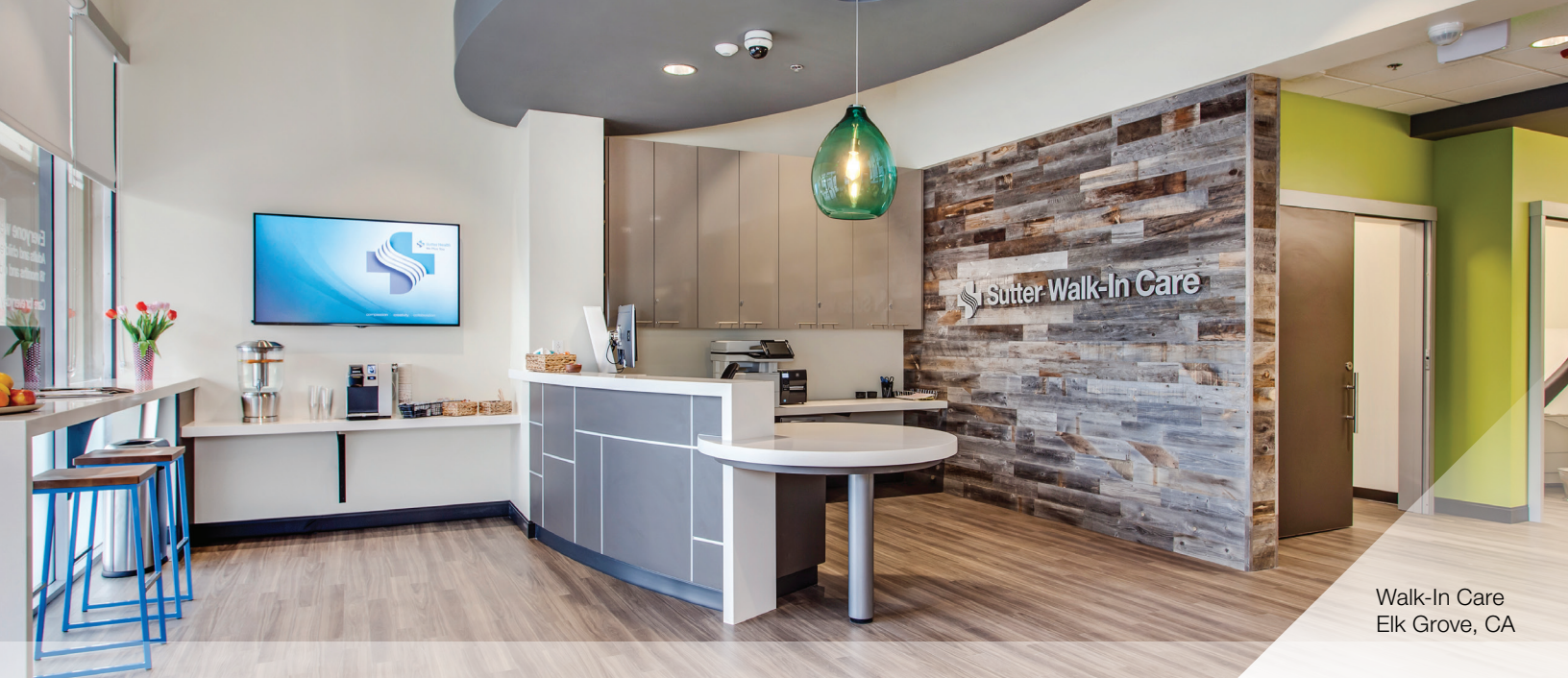
Walk-In Care Elk Grove, CA

Sutter Health Plus, a not-for-profit HMO, offers competitively priced health plans that give you access to a network of high-quality health care providers, including many of Sutter Health's affiliated hospitals, doctors and health care services. Here, providers work together to offer you easily accessible and personalized care.