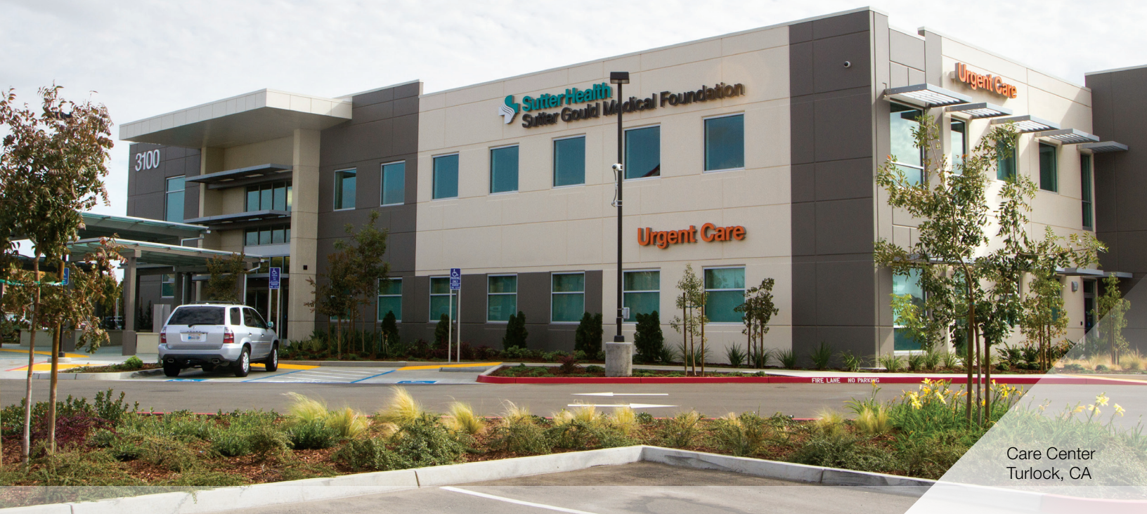
Care Center Turlock, CA

Sutter Health Plus, a not-for-profit HMO, offers competitively priced health plans that give you access to a network of high-quality health care providers, including many of Sutter Health’s affiliated hospitals, doctors and health care services. Here, providers work together to offer you easily accessible and personalized care.